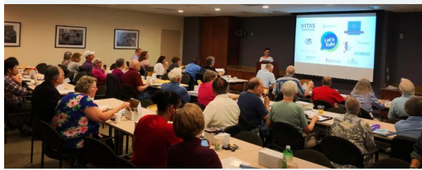
"Let's Talk!" ACP Audience